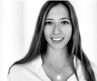
Marine Degraux Accountancy