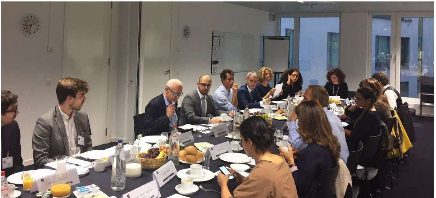
Expert exchange of views with MEP Michal Boni on E-Privacy Regulation revision