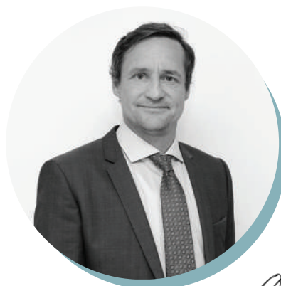
Oliver Süme EuroISPA President

Indeed from copyright reform to data retention and everything in between, EuroISPA will continue to serve as the voice of the European Internet industry, guiding legislation that advances Europe's trajectory towards true digitalisation.