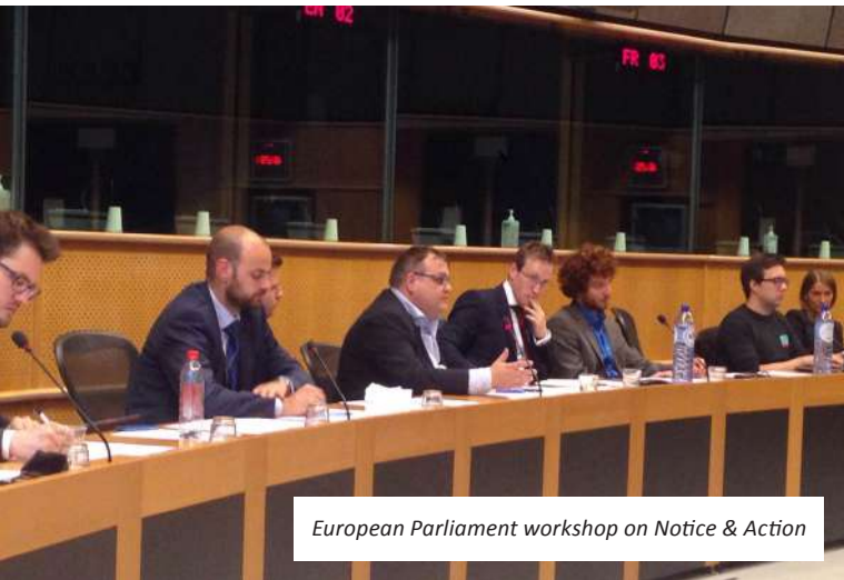
European Parliament workshop on Notice & Action