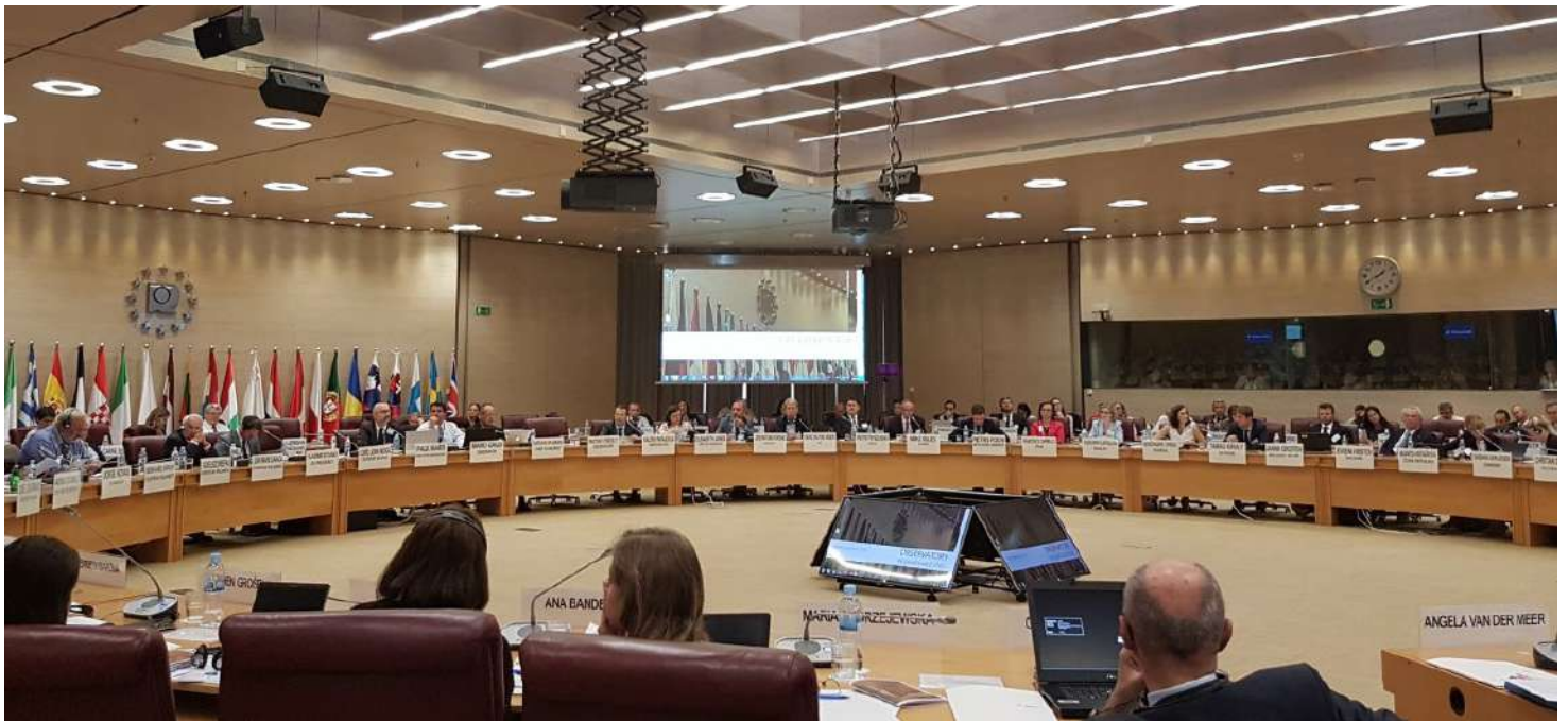
Plenary meeting of EU Observatory on Intellectual Property Rights infringements