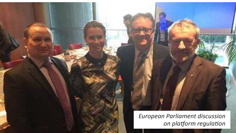
European Parliament discussion on platform regulation

The Octopus conference is the Council of Europe's flagship cybercrime forum, and brings together policymakers, law enforcement, and industry to discuss latest trends and future policy to tackle cybercrime in Europe.