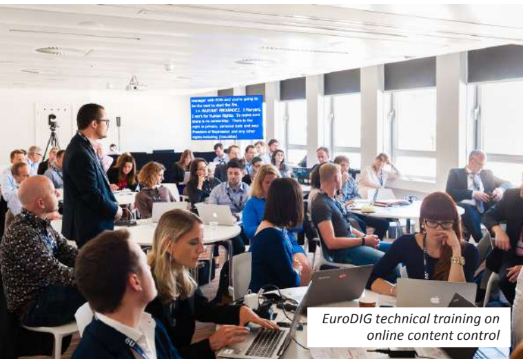
EuroDIG technical training on online content control

The event was co-hosted by MEP Henna Virkkunen (EPP, Finland) and MEP Julia Reda (Greens, Germany). These MEPs are amongst the lead drafters of the Parliament's upcoming political resolution on platform regulation.