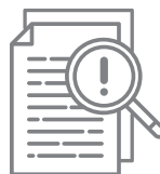
ILLEGAL CONTENT HOTLINES